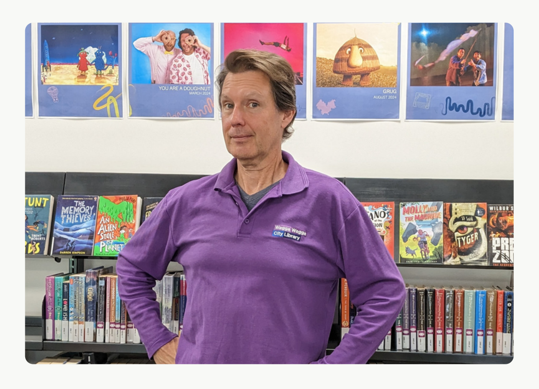
IT MIGHT BE PETER