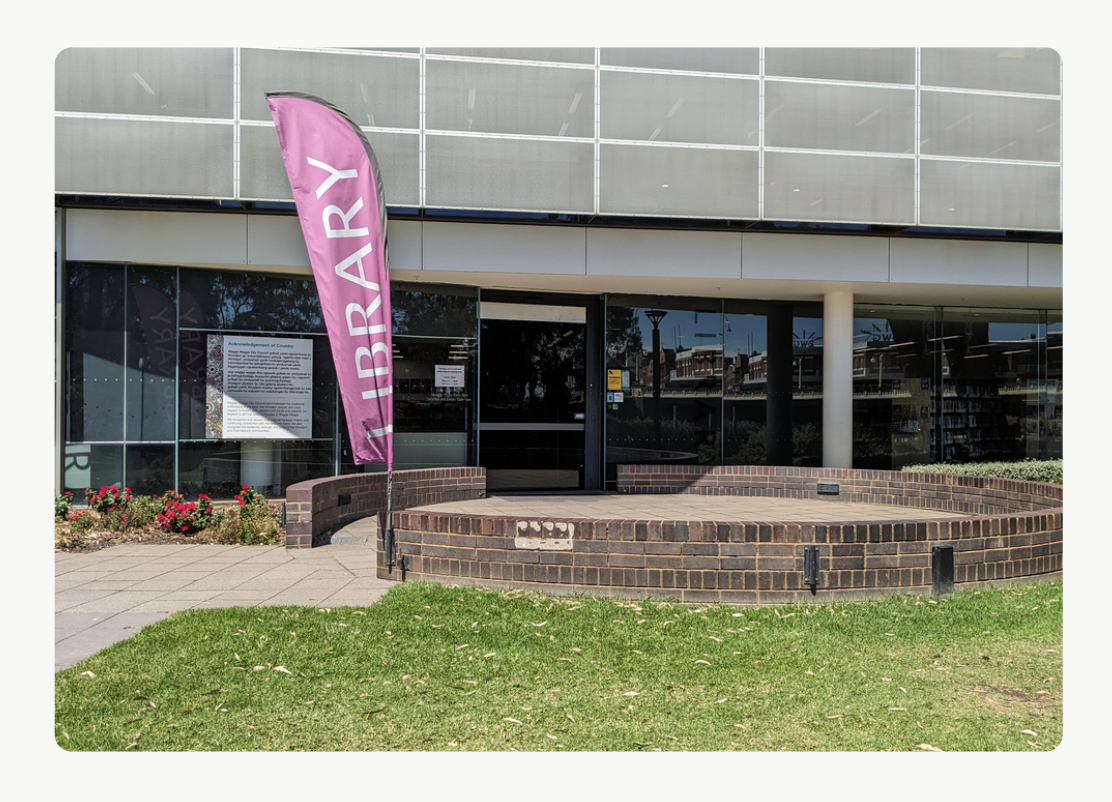
STORYTIME HAPPENS DOWNSTAIRS IN THE CHILDREN'S AREA