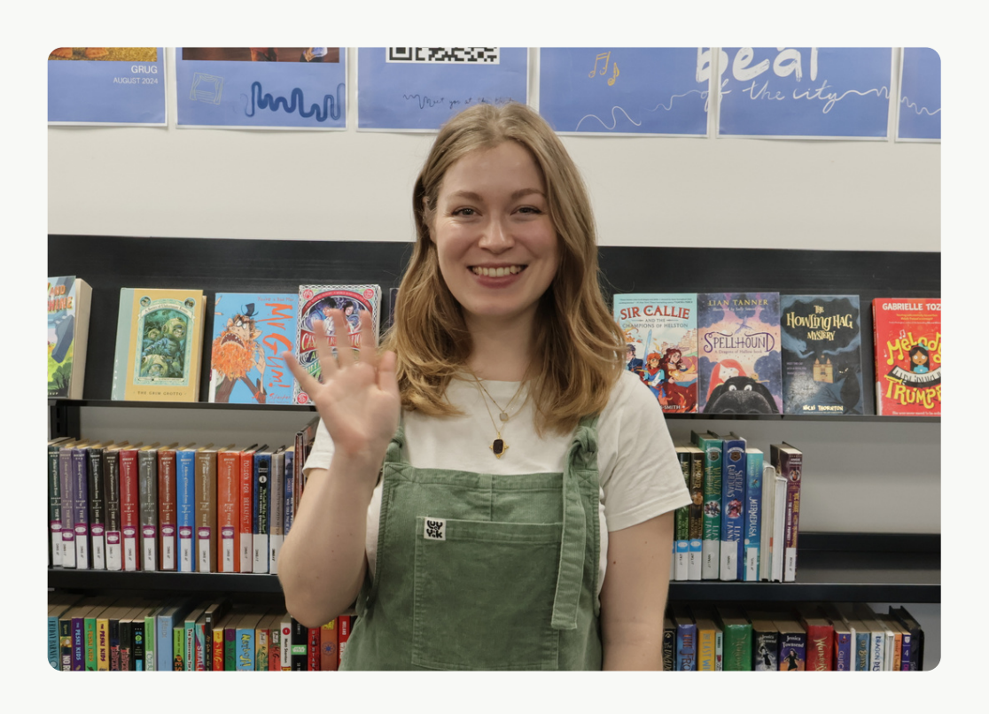
IT COULD BE CAT