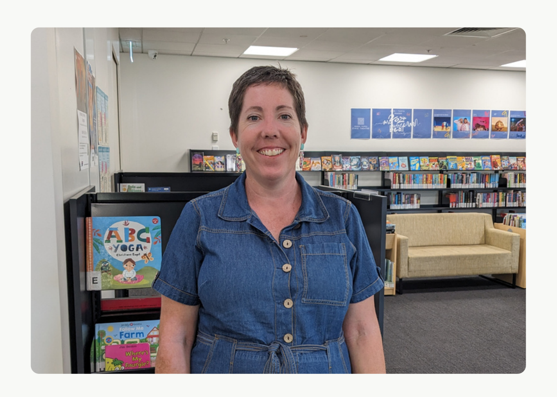
OR EVEN WENDY