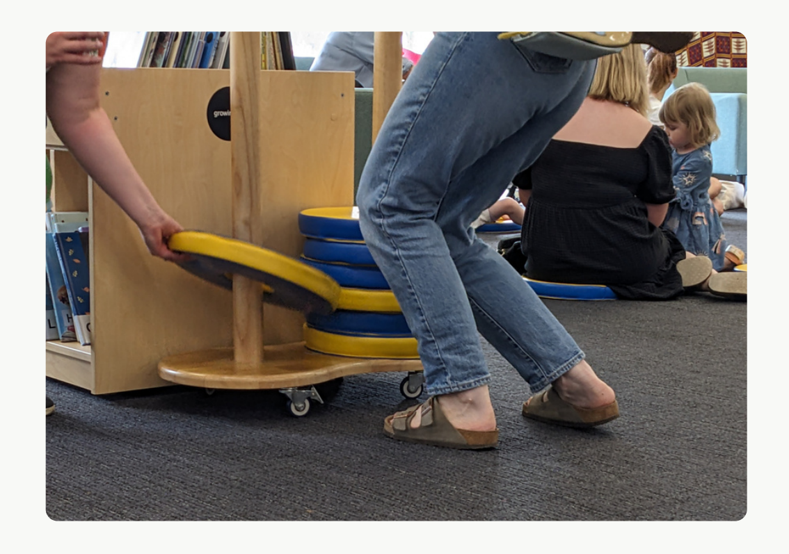
WE PICK UP A CUSHION AND FIND A SPOT TO SIT DOWN