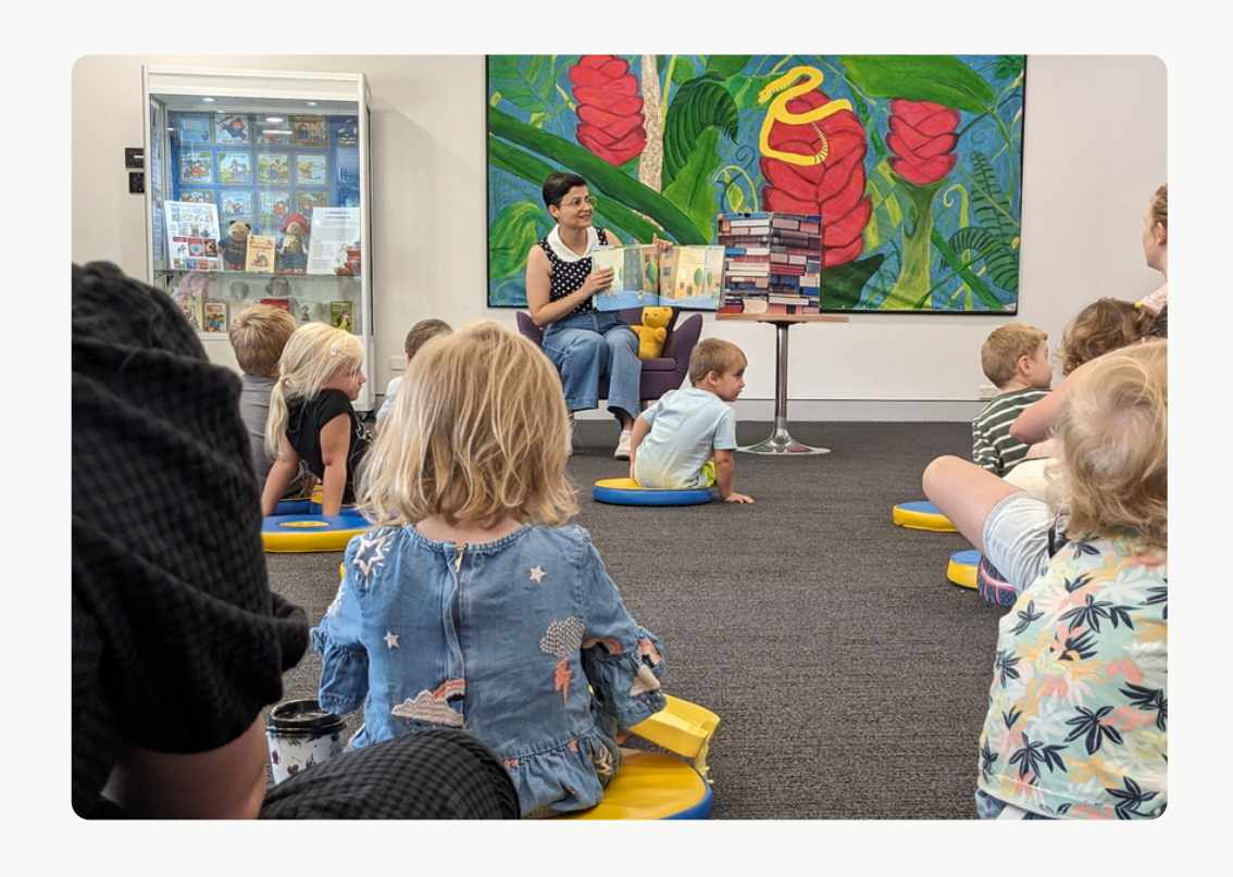
AFTER STRETCHES, WE SIT ON OUR CUSHIONS AND LISTEN