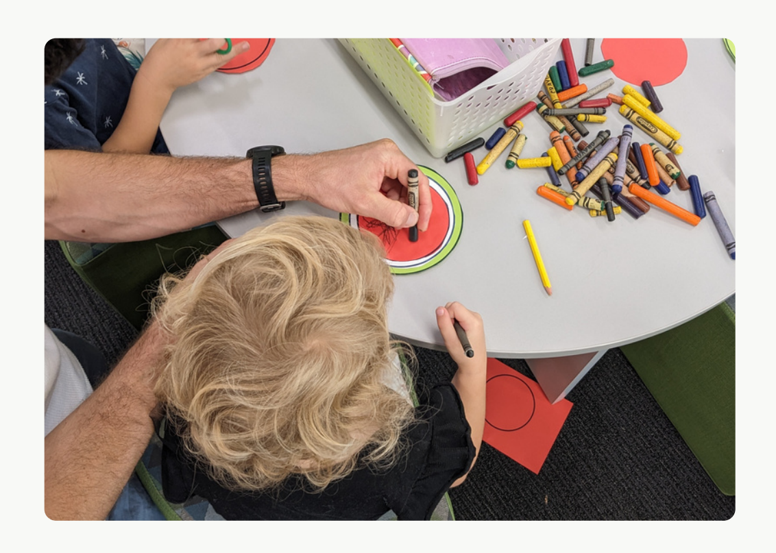
WHEN WE HAVE FINISHED READING WE MAKE A CRAFT