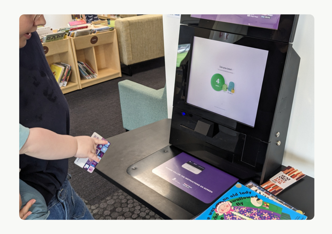
BEFORE WE GO HOME WE MIGHT BORROW SOME BOOKS OR DVDS