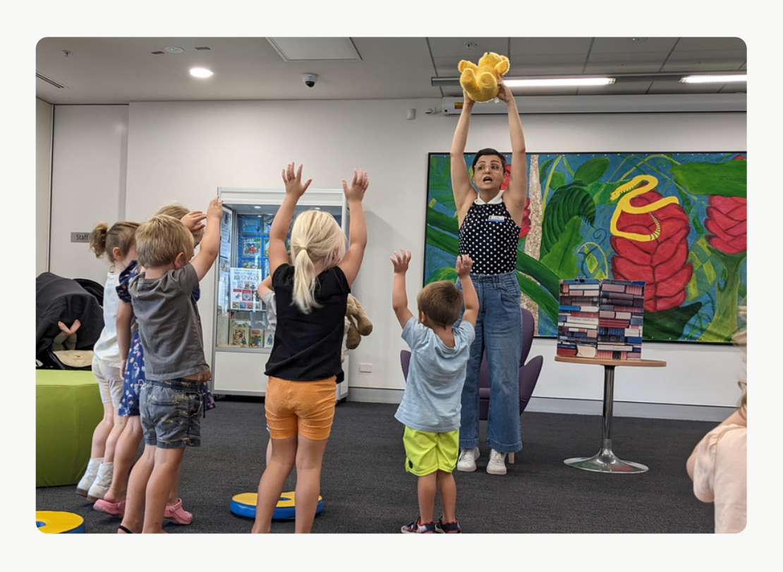
AT THE BEGINNING WE DO SOME STRETCHES