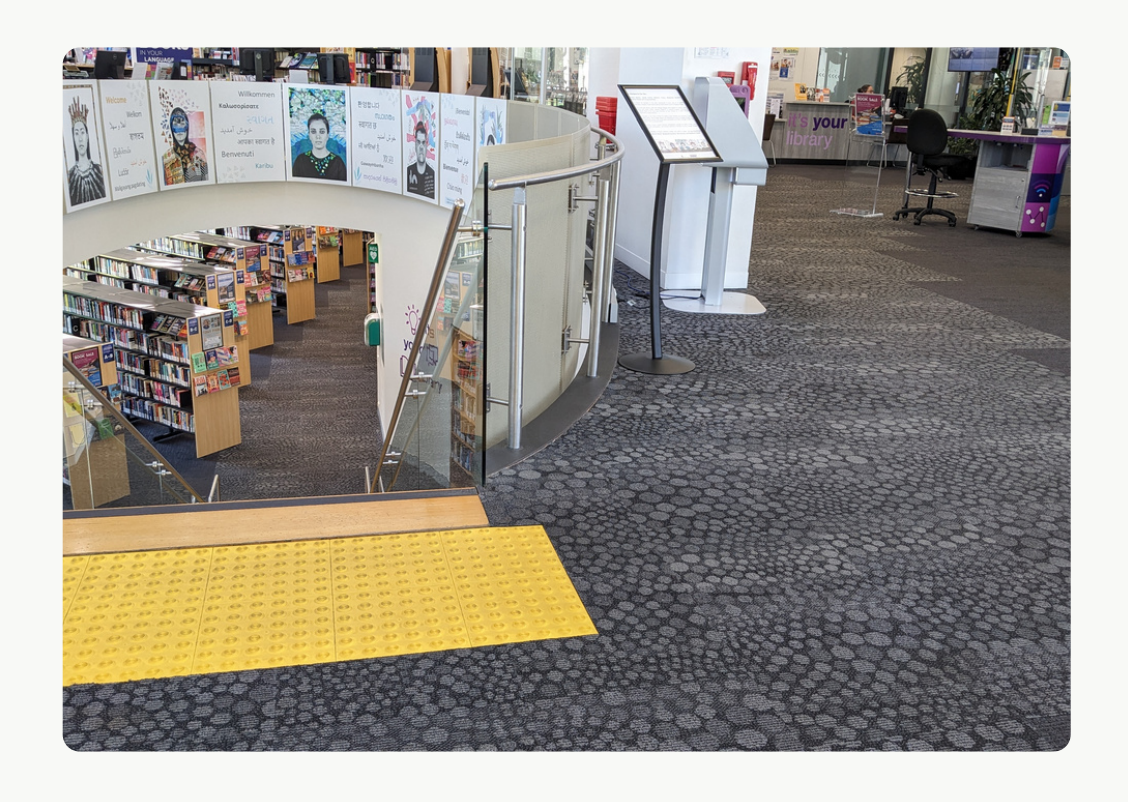
I CAN FOLLOW THE SPOTS ON THE CARPET TO THE STAIRS OR THE LIFT