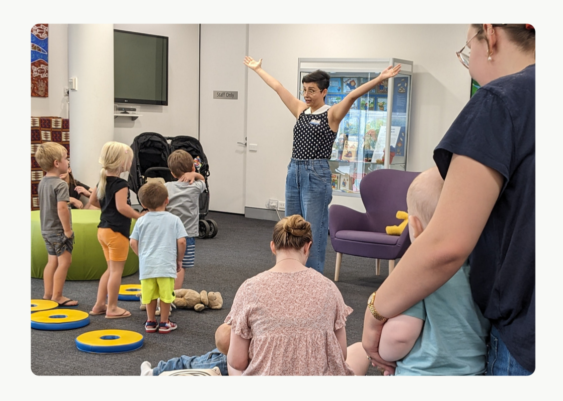
IN BETWEEN STORIES WE SING SONGS AND DANCE